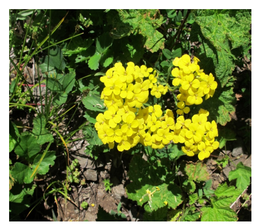
Alpine smelowskia and alpine wallflower on Mt. Townsend.