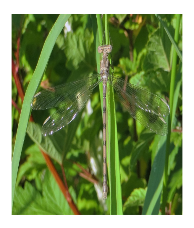
Damselfly