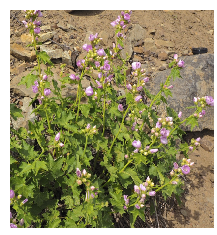
Challenge flowers from Gary Brill ("It's rare until proven common")