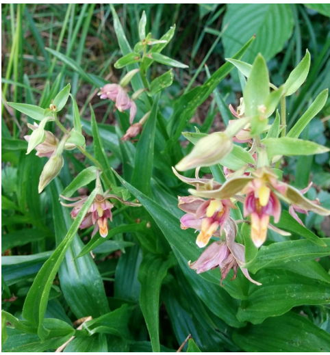
Alpine garden and stream orchid in our species garden